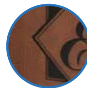
Brown Cover Engraves Black