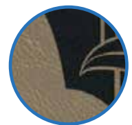
Tan Cover Engraves Black