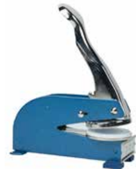
Long Reach Embosser

40 Gold Foil Seals per package. 2" Diameter.