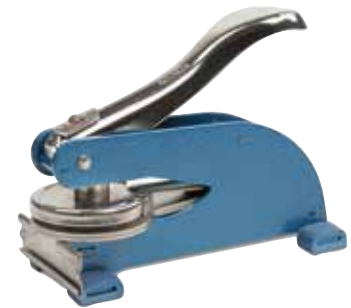
Standard Desk Embosser

Our embossers combine a metal frame with a die, typically made from a plastic polymer called Delrin. We offer three different styles of embossers, each of which have multiple imprint sizes. Refer to our tech sheet for specific requirements for artwork and state seals.